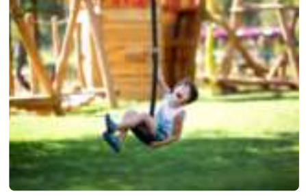
Kids Advanture Park