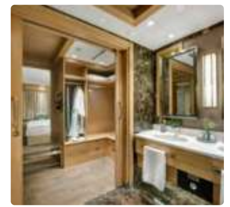
Dressing room & Bathroom