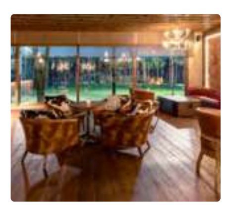
Sevk-Et Steakhouse Bar