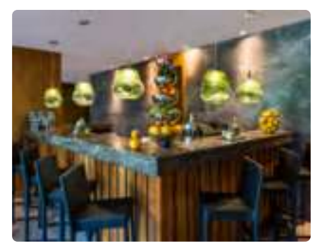
Zing Vitamin Bar