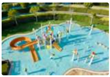
Aquapark Kids Pool

Pools may be temporarily closed due to adverse weather conditions, safety and pool hygiene.