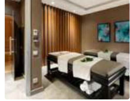
Massage Room & Sauna