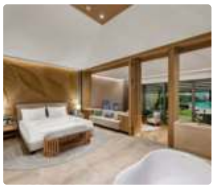
Bedroom & Living Room

*The pools of Amber Lagoon Villa and Suites are heated. Regnum Carya reserves the right to turn on or turn off the pool heating systems of the Amber Lagoon Villa and Suites depending on the number of guests, weather conditions, and other operational reasons.