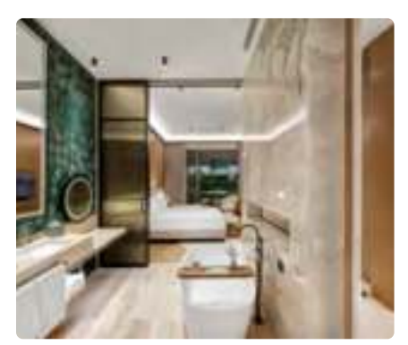
Bathroom & Dressing Room