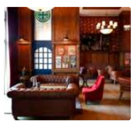
The Shamrock Irish Bar