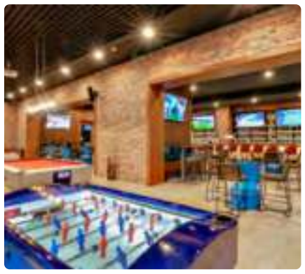
Score Sports Bar

*Wall's in UK / Inmarko in Russia /Langnese in Germany