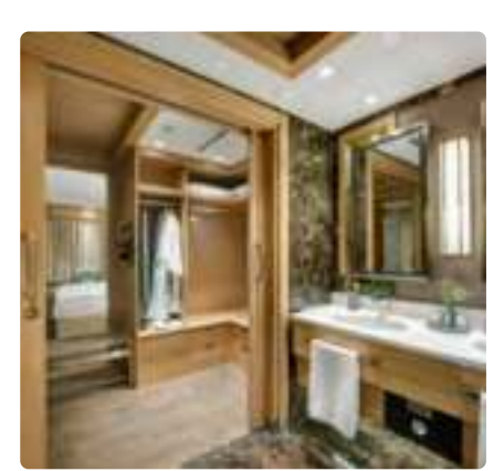
Dressing Room & Bathroom