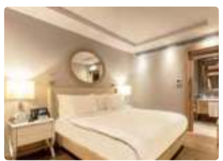
Bedroom (King Bed)